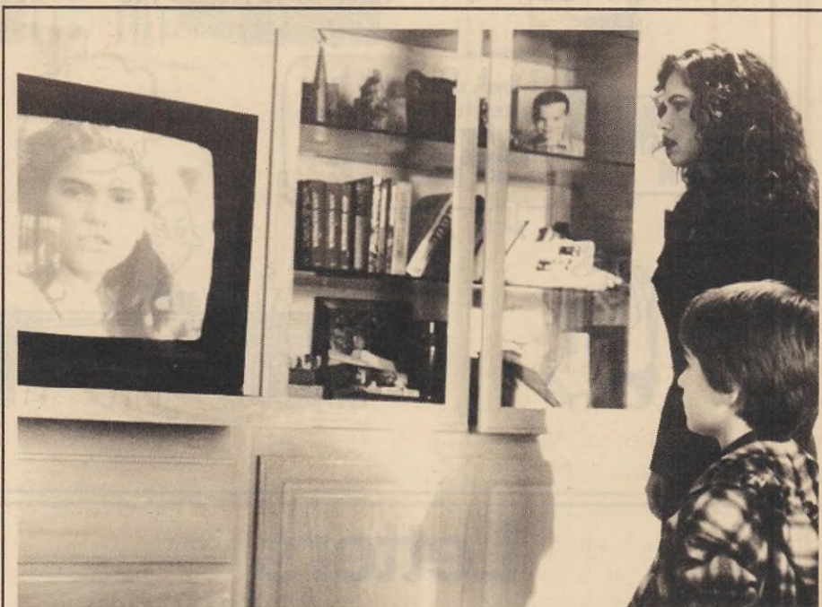
Heather Langenkamp and Miko Hughes star in “Wes Craven’s New Nightmare.”